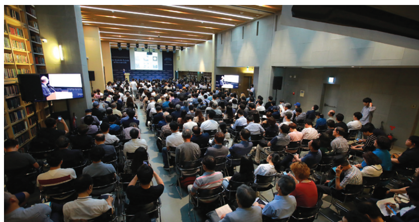
KFAS Conference Hall