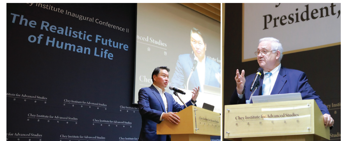
The Chey Institute Scientific Innovation Conference