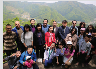
Visits to Afforestation Plant