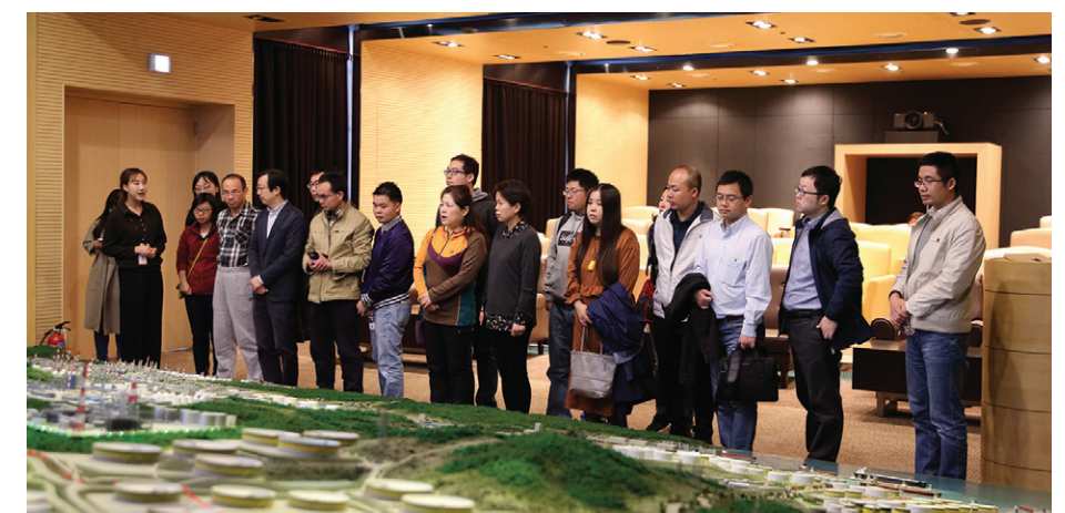
Visit to the SK Energy Ulsan Complex