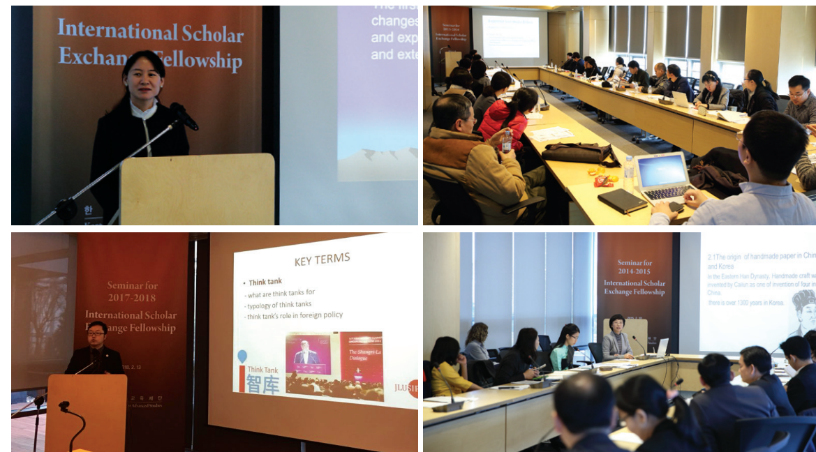
Academic seminars by ISEF fellows