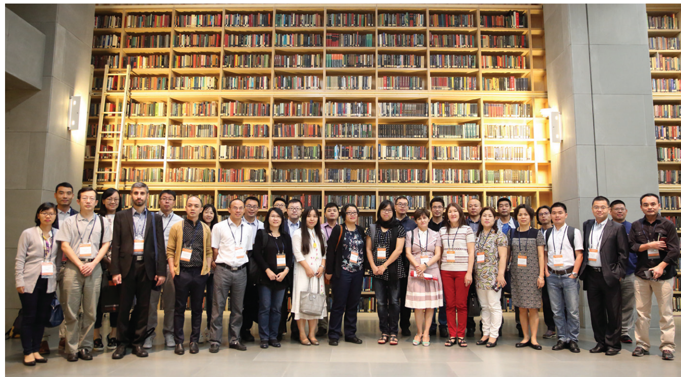
Arrival of ISEF Fellows

The ISEF program provides outstanding scholars with comprehensive research expenses during their stay in Korea, which include round-trip airfare, settlement support, a monthly research stipend, research grant and medical insurance. During their stay in Korea, fellows enjoy full access to the Chey Institute's facilities including seminar rooms and