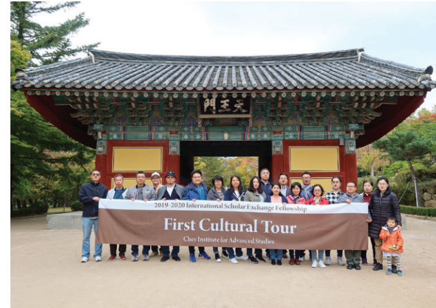
Cultural Tour for the 2019-2020 Fellows

University of Tehran Asia Research Center P.O. Box 11155-4563, 14174, Tehran, Iran T. 98-21-61112185 E. arc@ut.ac.ir