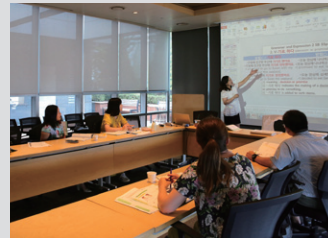
Korean Language Classes