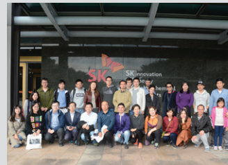
Visits to Industrial Site